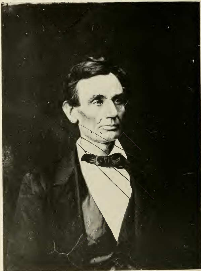
ORIGINAL NEGATIVE OF ABRAHAM LINCOLN AS RECEIVED FROM THE POST OFFICE DEPARTMENT